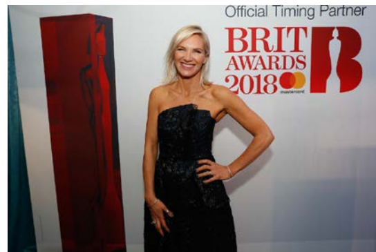
Liam Payne from One Direction and BBC2 radio presenter, Jo Whiley, receiving their timepieces

RAYMOND WEIL has made only a small quantity of the tango BRIT Awards 2018 Limited Edition collection available to purchase exclusively through www.raymond-weil.co.uk