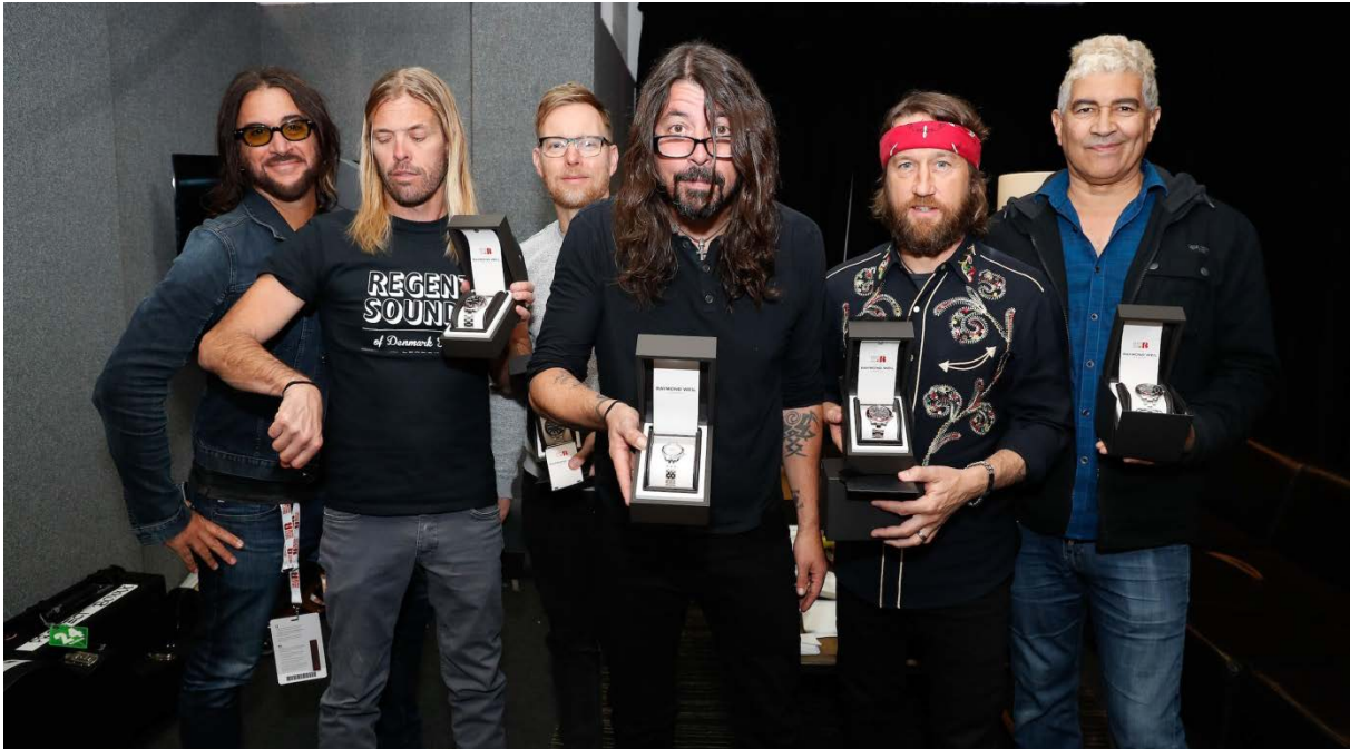
The Foo Fighters backstage, receiving their tango BRIT Awards 2018 Limited Edition timepieces

Luxury Swiss watchmaker, RAYMOND WEIL, celebrated its association with the 2018 BRIT Awards with MasterCard at last night's star-studded ceremony held at London's O2 Arena. The brand continued as the Official Time Partner of the UK's premier music awards ceremony, celebrating the best of both British and international musical achievements throughout 2017.