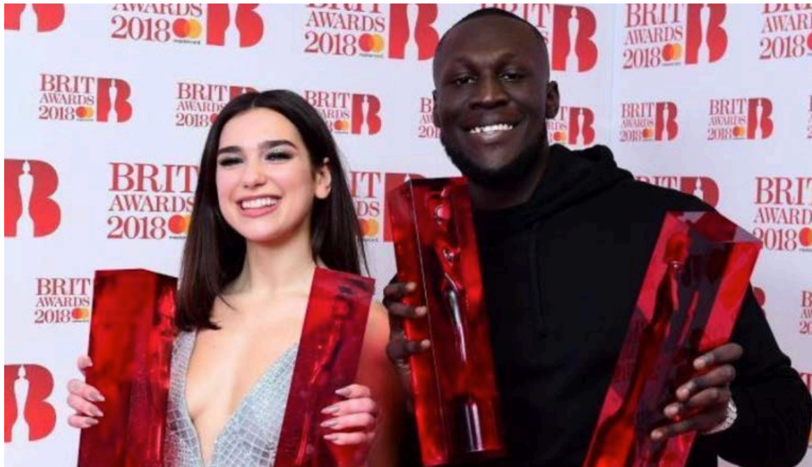
BRIT Awards winners, Dua Lipa and Stormzy celebrating their wins last night

The big winners of the night were Stormzy and Dua Lipa, who each received two BRIT Awards, marking an amazing year for both artists. Other winners included Ed Sheeran, Foo Fighters, Kendrick Lamar, Lorde, Harry Styles and Rag N' Bone Man.