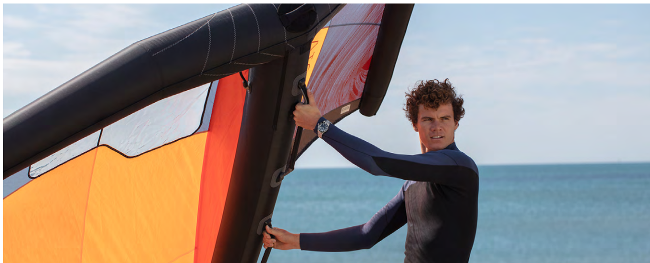
Titouan Galea, three-time Wing Foil World Champion.